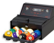
Art.516 EUR 304.00 TIMER-16B for Pool (16x57mm) Size: 26x26x19cm. - Weight: 6.5kg.