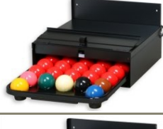
Art.422 EUR 248.00 BOX-22B Wall mount. For Snooker (22x52-54mm) Size: 32x32,5xH11,2+7,8cm. - Weight: 8.38kg.