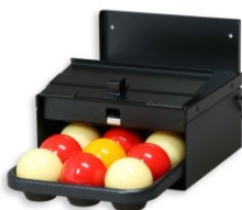
Art.409 EUR 176.00 BOX-9B Wall mount. For 9 balls (9x61.5mm) Size: 21,5x22xH11,2+7,8cm. - Weight: 4.35kg.