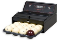
Art.516B EUR 317.00 TIMER-16B/68 for Russian Pyramid (16x68mm) Size: 32x32,5x19,5cm. - Weight: 9kg.