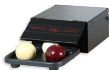
Art.403A/L EUR 176.00 BOX-3B/A Low version. For Italiana game (2x68 +1x59mm) Size: 21,5x22xH11,2cm. - Weight: 4.25kg.