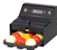
Art.509 EUR 264.00 TIMER-9B for 9 balls (9x61.5mm) Size: 21,5x22x19cm. - Weight: 5.1kg.