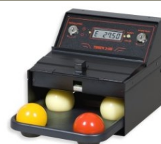
Art.504 EUR 264.00 TIMER-4B for 4 balls (4x61,5mm) Size: 21,5x22x19cm. - Weight: 5.1kg.