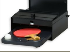
Art.402 EUR 216.00 BOX PING-PONG wall mount Size: 26x26xH11,2+7,8cm. - Weight: 5.9kg.