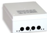
Art.740 EUR 213.00 CONTROL-LAMP-8 (8 lamps controller) Size: 24,5x19,7x9,5cm. - Weight: 1.25kg.