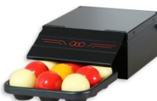
Art.409/L EUR 176.00 BOX-9B Low version. For 9 balls (9x61.5mm) Size: 21,5x22xH11,2cm. - Weight: 4.25kg.