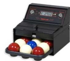
Art.509A EUR 264.00 TIMER-9B/A for 9 balls (8x59 + 1x54mm) Size: 21,5x22x19cm. - Weight: 5.1kg.