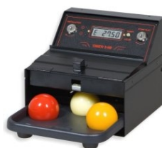
Art.503 EUR 264.00 TIMER-3B for Carom billiards (3x 61.5-63.2mm) Size: 21,5x22x19cm. - Weight: 5.1kg.

HOURLY BANDS. Useful for taking advantage of peak hours, both daily and weekly. Three hourly rates can be programmed and they may alternate automatically on programmable hourly periods.