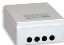
Art.730 EUR 187.00 CONTROL-BALL-16 (16BOXes controller) Size: 24,5x19,7x9,5cm. - Weight: 1.5kg.