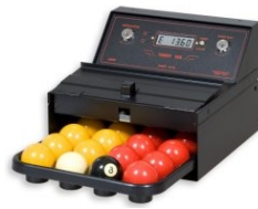
Art.516A EUR 312.00 TIMER-16B/52 for English Pool (16x50-52mm) Size: 26x26x19cm. - Weight: 6.63kg.