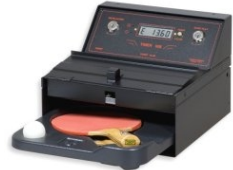
Art.502 EUR 296.00 TIMER PING-PONG Size: 26x26x19cm. - Weight: 6.5kg.