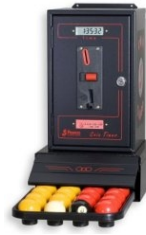
Art.216A EUR 528.00 COIN TIMER-16B/52 for English pool (16x52mm) Size: 26x47x26cm. - Weight: 11.4kg.