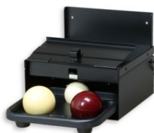
Art.403A EUR 176.00 BOX-3B/A Wall mount. For Italiana game (2x68 +1x59mm) Size: 21,5x22xH11,2+7,8cm. - Weight: 4.35kg.