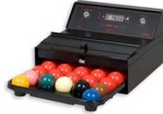
Art.522 EUR 328.00 TIMER-22B for Snooker (22x52-54mm) Size: 32x32,5x19cm. - Weight: 8.93kg.