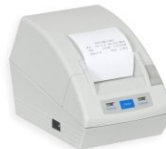
Art.710 EUR 395.00 PRINTER for MICRO32 Size: 17x12x10,5cm. - Weight: 1.4kg.