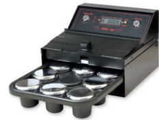
Art.528-82 EUR 370.00 TIMER-8P2 for 8 pucks D59mm H25mm for shuffleboard It is used to contain and control 8 pucks for shuffleboard with 59mm diameter and 25mm height. Size: 21,5x22x19cm. - Weight: 5,15kg.