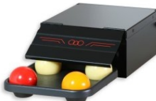
Art.404/L EUR 176.00 BOX-4B Low version. For 4 balls (4x61.5mm) Size: 21,5x22xH11,2cm. - Weight: 4.25kg.