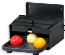
Art.403 EUR 176.00 BOX-3B Wall mount. For Carom billiards (3x 61.5-63.2mm) Size: 21,5x22xH11,2+7,8cm. - Weight: 4.35kg.