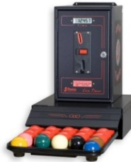
Art.222 EUR 552.00 COIN TIMER-22B for snooker (22x52-54mm) Size: 32,5x47x32,5cm. - Weight: 13.6kg.