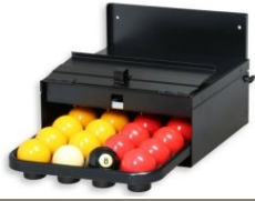
Art.416A EUR 224.00 BOX-16B/52 Wall mount. For English pool (16x50-52mm) Size: 26x26xH11,2+7,8cm. - Weight: 6.13kg.