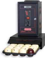
Art.216B EUR 544.00 COIN TIMER-16B/68 for Russian Pyramid (16x68mm) Size: 32,5x47,5x32,5cm. - Weight: 13.6kg.