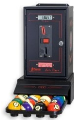
Art.216 EUR 520.00 COIN TIMER-16B for Pool table (16x57mm) Size: 26x47x26cm. - Weight: 11.4kg.