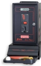
Art.202 EUR 520.00 COIN TIMER PING-PONG Size: 26x47x26cm. - Weight: 11.4kg.