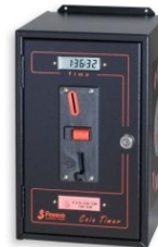
Art.200 EUR 320.00 COIN TIMER Size: 21,5x35,5x21,5cm. - Weight: 6kg.