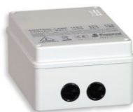
Art.728 EUR 128.00 CONTROL-BALL-4 (4 BOXes controller) Size: 16x12x7,7cm. - Weight: 1.07kg.

There are also available BOXES for fitting underneath the billiard table with appropriate brackets; their code number has the word /S added.