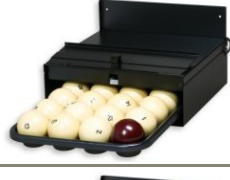
Art.416B EUR 240.00 BOX-16B/68 Wall mount. For Russian Pyramid (16x68mm) Size: 32x32,5xH11,8+7,8cm. - Weight: 8.4kg.