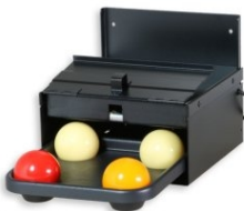
Art.404 EUR 176.00 BOX-4B Wall mount. For 4 balls (4x61.5mm) Size: 21,5x22xH11,2+7,8cm. - Weight: 4.35kg.