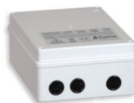
Art.729 EUR 153.00 CONTROL-BALL-8 (8 BOXes controller) Size: 20x15x8cm. - Weight: 1.24kg.