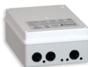
Art.739 EUR 162.00 CONTROL-LAMP-4 (4 lamps controller) Size: 20x15x8cm. - Weight: 0.7kg.

For the control of packs of playing cards.