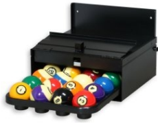
Art.416 EUR 216.00 BOX-16B Wall mount. For Pool (16x57mm) Size: 26x26xH11,2+7,8cm. - Weight: 6kg.