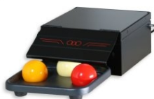
Art.403/L EUR 176.00 BOX-3B Low version. For Carom billiards (3x 61.5-63.2mm) Size: 21,5x22xH11,2cm. - Weight: 4.25kg.