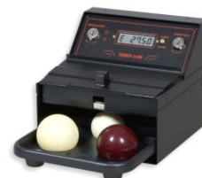
Art.503A EUR 264.00 TIMER-3B/A for Italiana game (2x68 + 1x59mm) Size: 21,5x22x19cm. - Weight: 5.1kg.